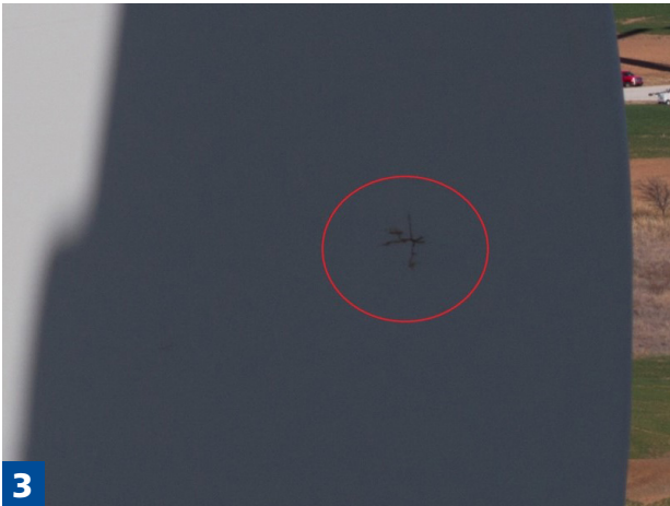
Proprietary AI is able to extract damage and locate anomalies in less than optimal capture conditions.

“ EDDIE does it all with a 98% confidence level. ”